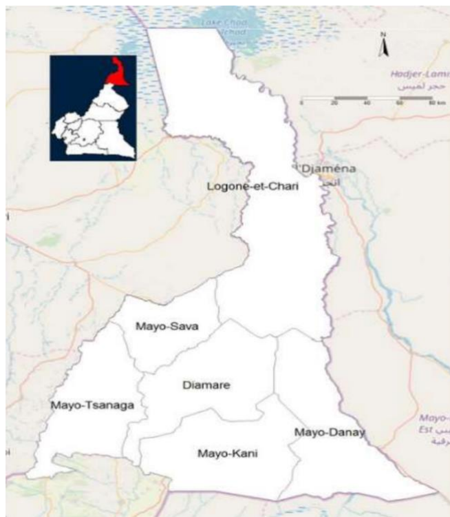
Figure 2: Administrative Map of the Far North Region (NIS 2020, 4)

poverty, which exposes the youth to the temptation of joining the ranks of terrorists, hoping they will have a better socio-economic condition.